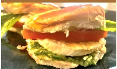
Sweet brioche bun, sliced tomato, fresh mozzarella, jalapeño spread, glazed balsamic and basil