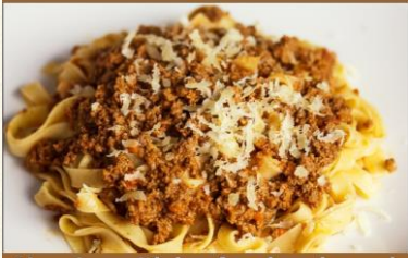
Linguine with beef and pork ragu' sauce and parmigiano cheese