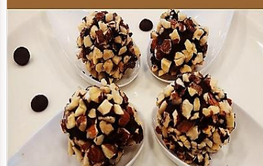
Angel cake with sambuca liquor, dipped in chocolate and almonds