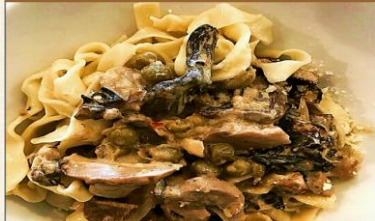
Linguine with wild mushrooms, peas, onions on a white creamy sauce, topped with parmigiano cheese