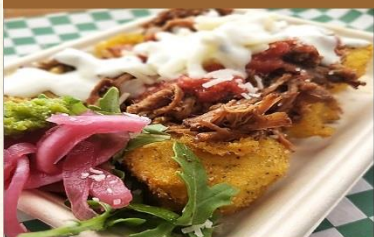
Fried polenta bites, loaded with tri-tip, mozzarella cheese, sour cream and chives, garnished with pickled onions and jalapeño paste