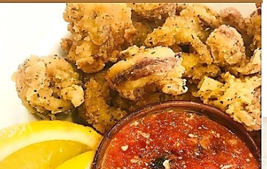
Fried calamari, served with polenta bites and Che Buono marinara sauce