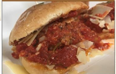
Slider with pork and beef meatball, Che Buono marinara sauce, mozzarella and parmigiano cheese