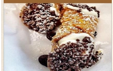
Tube-shaped pastry, filled with ricotta mixed with sambuca liquor, and chocolate calette