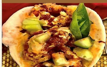
Flatbread with fried calamari, cucumber, basil, aioli with red spicy sauce, jalapeño and glazed balsamic