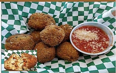
Fried rice balls, with Bolognese meat sauce, peas and cheese