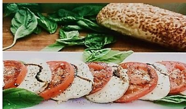
Tomatoes, mozzarella, balsamic vinegar, salt, pepper and basil