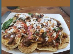
Nachos chips, shredded mozzarella, tri-tip, chopped caprese salad, chive crema, spicy aioli,