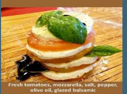
Fresh tomatoes, mozzarella, salt, pepper, olive oil, glazed balsamic