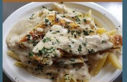
Penne with creamy white sauce, crispy butter-fried chicken, parsley and parmigiano cheese