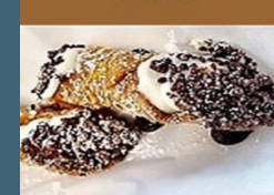
Tube-shaped pastry, filled with ricotta mixed with sambuca liquor, and chocolate calette