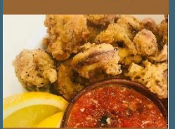
Fried calamari, Che Buono marinara sauce