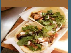
Flatbread, tri-tip, chopped caprese with basil, chives and garlic crema, pecorino cheese and arugula