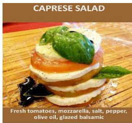
Fresh tomatoes, mozzarella, salt, pepper, olive oil, glazed balsamic