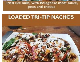
Nachos chips, shredded mozzarella, tri-tip, chopped caprese salad, chive crema, spicy aioli, arugula, glazed balsamic