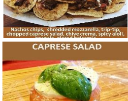
Fresh tomatoes, mozzarella, salt, pepper, olive oil, glazed balsamic