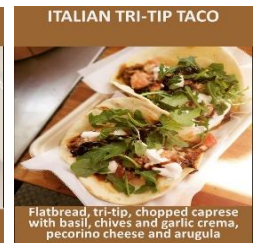
Flatbread, tri-tip, chopped caprese with basil, chives and garlic crema, pecorino cheese and arugula