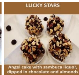
Angel cake with sambuca liquor, dipped in chocolate and almonds