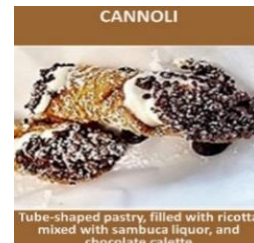
Tube-shaped pastry, filled with ricotta mixed with sambuca liquor, and chocolate calette