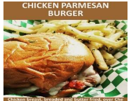
Chicken breast, breaded and butter-fried over Che Buono marinara sauce and mozzarella. Add fries for a complete meal.