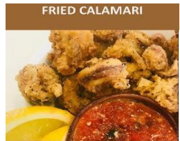
Fried calamari, Che Buono marinara sauce