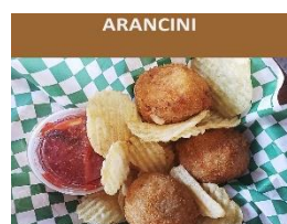
Fried rice balls, with Bolognese meat sauce, peas and cheese